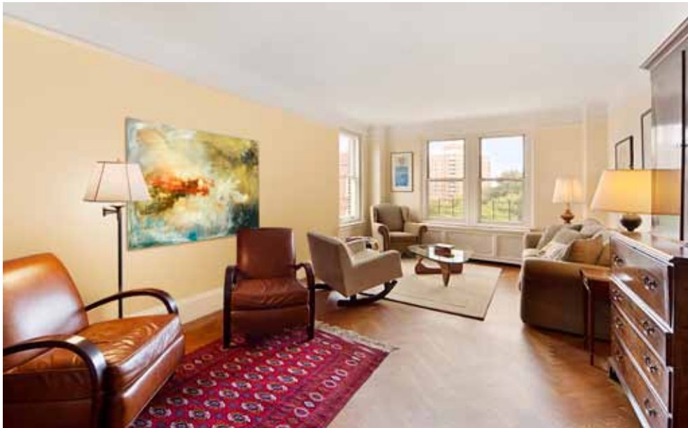
The light-filled corner living room is large enough for two seating areas.