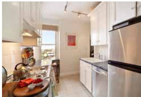
In the L-shaped, windowed kitchen you'll enjoy plenty of counter space and storage, double sink, and new refrigerator and dishwasher.