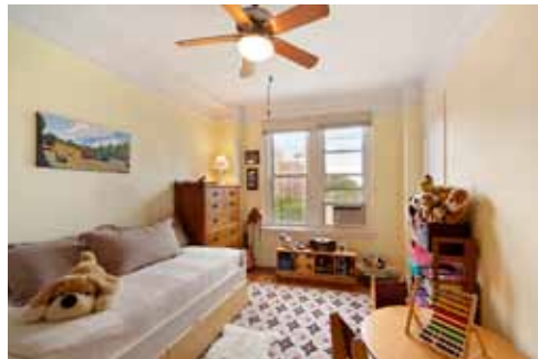
Each of the three bedrooms includes a convenient adjoining bathroom.