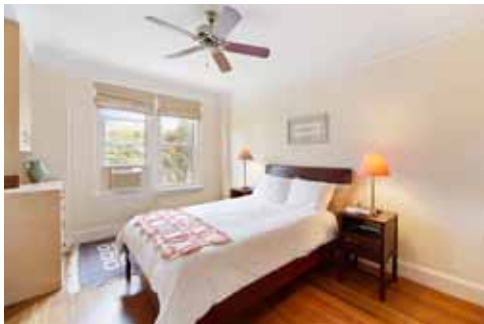
The master bedroom's walk-in closet and custom-made floor-to-ceiling built-in closet are among the unit's eight closets.