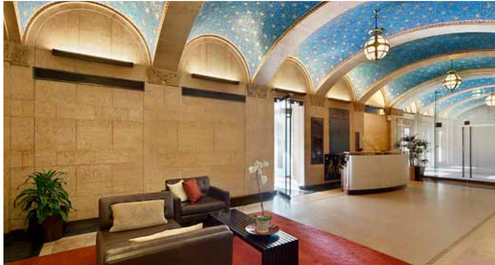
Entrance to One Hanson Place—known for its red-lit clock and gorgeous lobby's precious blue mosaic-tiled arched ceiling.

Make this one bedroom plus home office yours! One Hanson Place, which was formally known as The Williamsburgh Savings Bank, is now a landmarked loft building that rises 34 floors over the nexus of Brooklyn's most popular neighborhoods: Boerum Hill, Cobble Hill, Ft. Greene, Park Slope and Prospect Heights. Apartment 17B includes, a custom kitchen with Sub Zero and Viking appliances, lava stone counters, Kallista faucets and cream lacquer cabinetry. The east and north facing living room windows allow tremendous natural light to flow through the apartment. The picturesque views of The Williamsburg bridge, The Empire state building and midtown Manhattan are breathtaking.