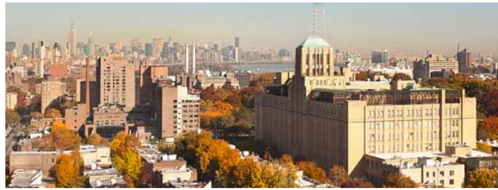
Views of Williamsburg bridge, midtown Manhattan, & The Empire State Building!

COVER PAGE TOP: Modern stainless steel kitchen with Viking appliances, perfect for entertaining. COVER PAGE INSET: Front entrance of this landmarked, full-service, 24-hour doorman building.