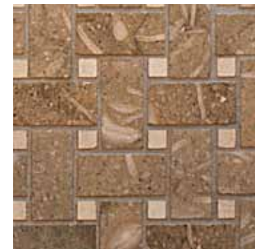
Mosaic stone tile detail.