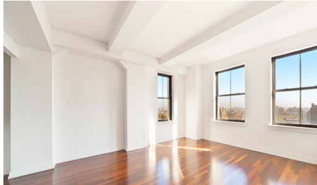
The east and north facing living room allows for an abundance of natural light to flow through, while overlooking rooftops of Fort Greene's historic brownstones.