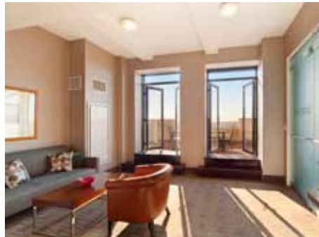
Residents-only sky lounge with terrace.