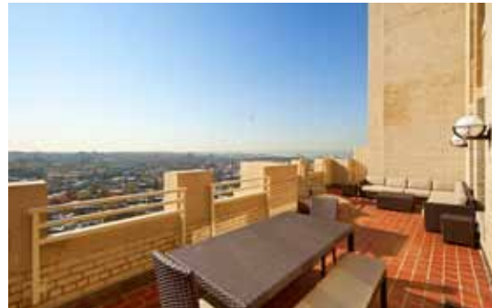
One of the four furnished common terraces with panoramic views.

COVER PAGE TOP: Modern stainless steel kitchen with Viking appliances, perfect for entertaining. COVER PAGE INSET: Front entrance of this landmarked, full-service, 24-hour doorman building.