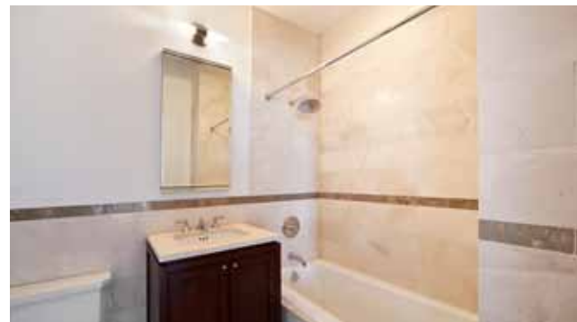
Beautifully designed bathroom with Kallista fixtures and mosaic stone floors.