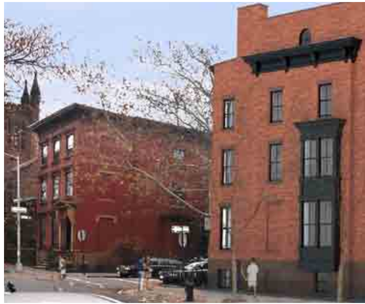
Corner of Strong Place and Kane Street in the heart of the Cobble Hill Historic District.