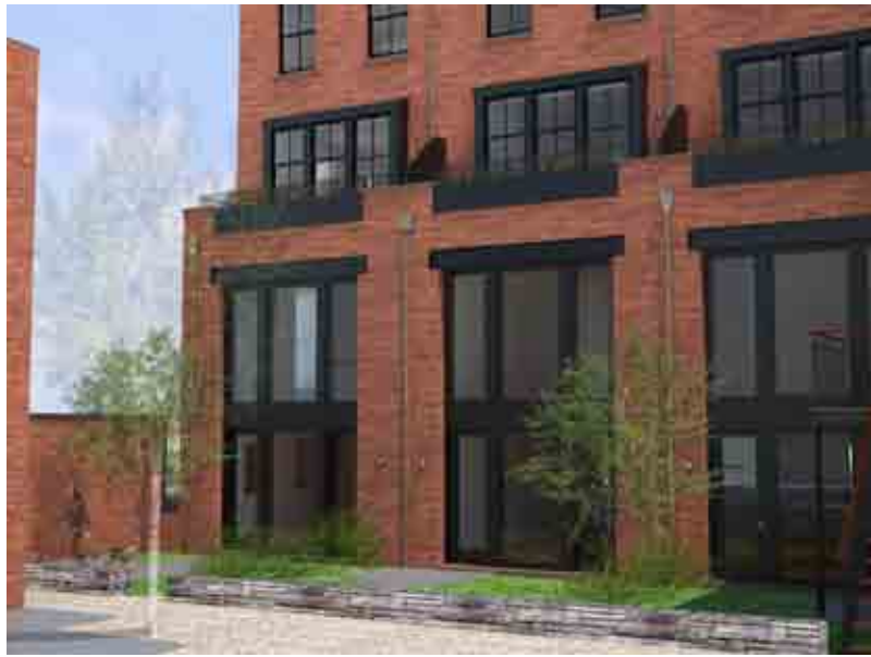
Spacious garden visible through double-height window wall.