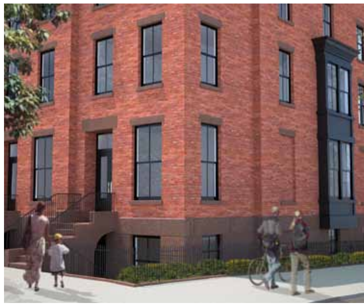
Corner of Strong Place and Kane Street in the heart of the Cobble Hill Historic District.