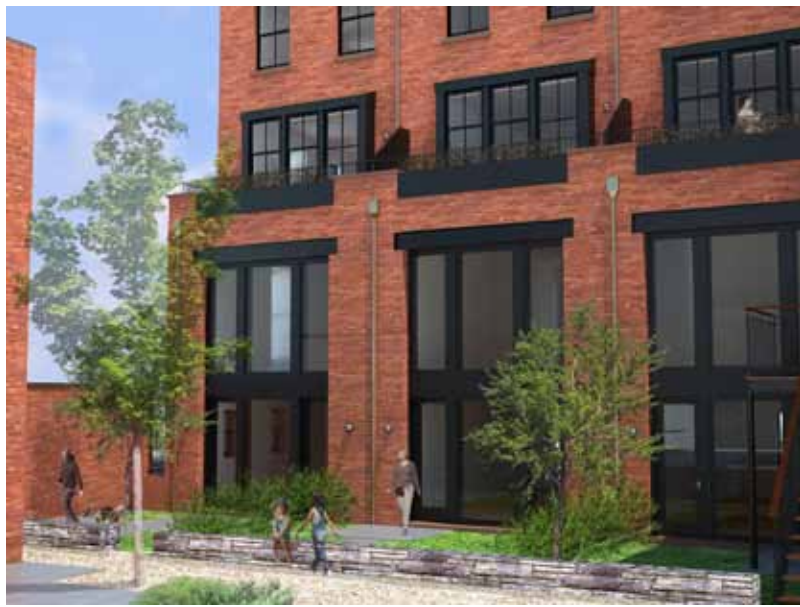
Spacious garden visible through double-height window wall.