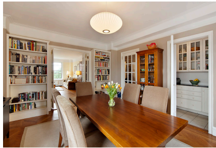
39 Plaza Street West, #5A PARK SLOPE Three-Bedroom Cooperative $1,200,000