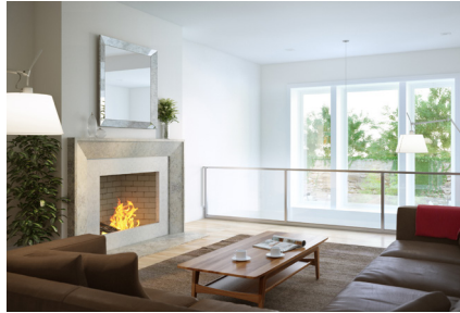
4 Strong Place COBBLE HILL Single-Family Townhouse $4,850,000