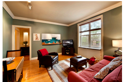
128 Willow Street, #4E BROOKLYN HEIGHTS One-Bedroom Cooperative $443,000