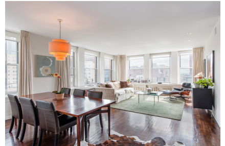
75 Livingston Street, #8CD BROOKLYN HEIGHTS 4-bedroom Cooperative $2,850,000