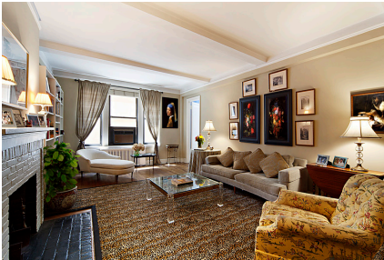
220 East 73rd Street, #3F UPPER EAST SIDE One-Bedroom Cooperative $715,000