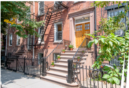
99 Kane Street COBBLE HILL WEST Two-Family Townhouse $2,800,000