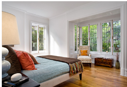
24 Remsen Street, #2 BROOKLYN HEIGHTS Two-Bedroom Condominium $1,950,000