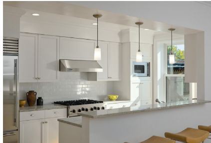
24 Remsen Street, #4 BROOKLYN HEIGHTS 4-bedroom Condominium $2,950,000