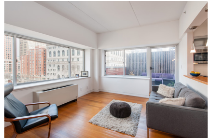
87 Smith Street, #5A BOERUM HILL One-Bedroom Condominium $629,000