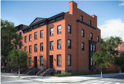
2 Strong Place COBBLE HILL Single-Family Townhouse $7,500,000