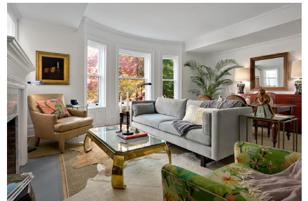
24 Remsen Street, #3 BROOKLYN HEIGHTS Two-Bedroom Condominium $1,730,000