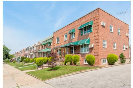
8943 16th Avenue BATH BEACH Two-Family Townhouse $765,000