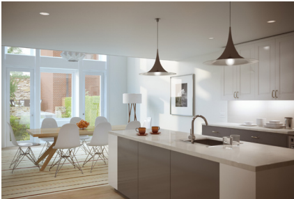
2A Strong Place COBBLE HILL Single-Family Townhouse $4,475,000