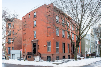
15 Willow Street BROOKLYN HEIGHTS Two-Family Townhouse $4,810,000