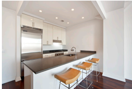
One Hanson Place, #17B FORT GREENE One-Bedroom Condominium $645,000