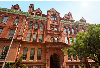
279 Sterling Place, #1G PROSPECT HEIGHTS One-Bedroom Cooperative $525,000