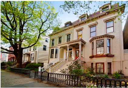
36 Cambridge Place FORT GREENE Two-Family Townhouse $1,715,000